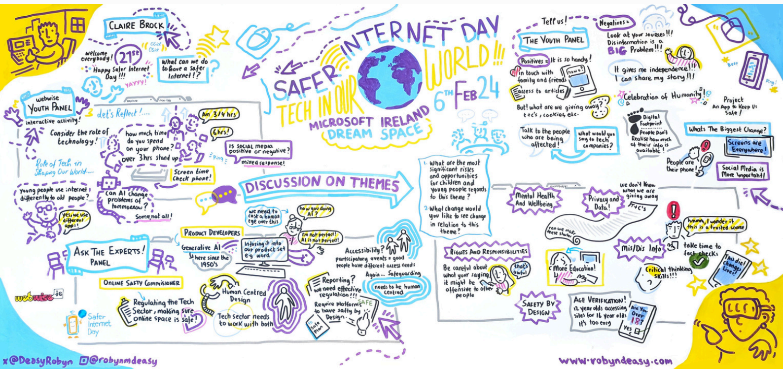
Artist visualisation from Safer Internet Day 2024